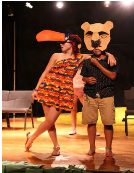
The Lion King

make their own mask to depict their assigned character. RA's helped with creating extra animals and basic set pieces. A few Climbers volunteered to work backstage and handle the distribution and changing of the wireless microphones (which takes a gifted mind for sure!). It was truly a team effort! This year, we were able to expand the performance to two nights – one night for the Climbers and one night for parents and visitors. The music was moving, lines memorized and delivered with emotion, and it all ended with a standing ovation and even a few tears that it was over. My personal favorite part was watching them take that moment for their bow. You see this realization of accomplishment and pride spread across each face. It is my hope that this realization sticks with them over the course of the year and encourages them to try more and be more in the other 11 months.