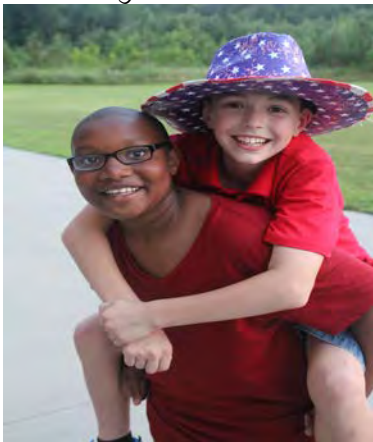
July 4 th Fun Time

Jacob's Ladder is a pro-active enrichment program serving children who are gifted and at risk for over 26 years.