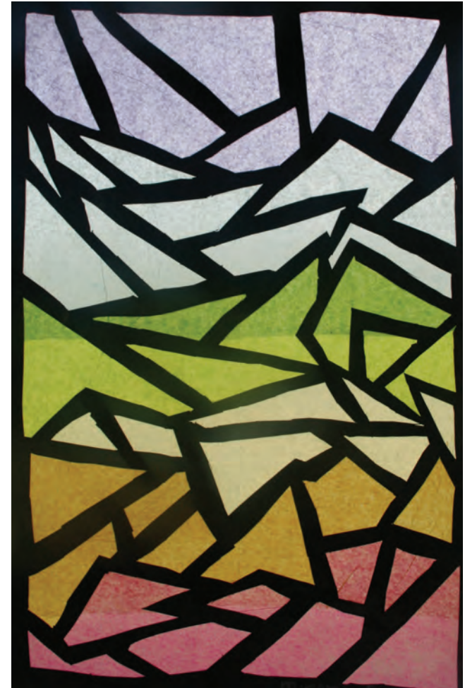
Artwork by a Climber from the "Stained Glass in Paper" class. Summer Enrichment Camp, 2016