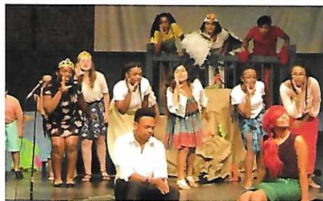
Climber musical, "A Little Mermaid"

Each year I am thrilled to watch teachers who are experts in their field take a week to pour into our gifted Climbers. The variety of classes this year was exceptional! Art (a different class each of the 4 weeks), Mindfulness, English, Math, Writing, Storytelling, French, Origami, Science (that focused on Oysters, Crabs and Fish), Debate, Finance, Coding, Law, and Socratic Seminar. These classes offered enrichment in the core subjects and beyond, providing Climbers the opportunity to explore and stretch their thinking. Of course, my favorite way to stretch our Climbers is in performing arts! I have done much research and am passionate about the ways performing can positively influence any career path. This year we performed the entire script (and many songs) from "A Little Mermaid Jr." I threw a huge script at them and requested that they memorize all lines in just one week. They rose to the occasion, and we were able to present our longest musical to date! It is my hope that the memories of working at this goal will inspire greatness in the Climbers in all areas of their lives.