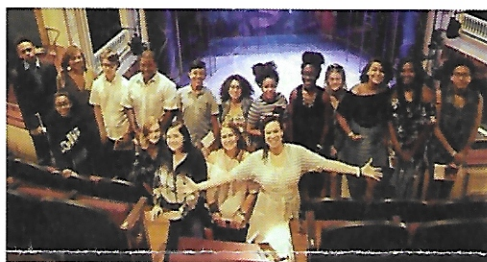
Senior fieldtrip to VA Repertory Theatre

"For I know the plans I have for you, says the Lord; plans for good and not for evil, to give you a hope and a future." – Jeremiah 29:11