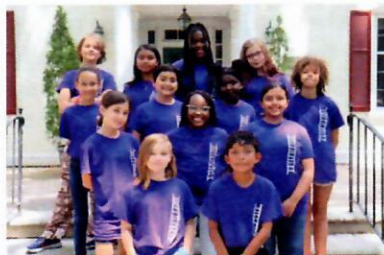
New Climbers – 2023

Encouraging Climbers to give back to the community is in the mission statement of Jacob's Ladder (JL). This summer, we saw this mission lived out as seven RAs and three summer program directors were Alumni Climbers.